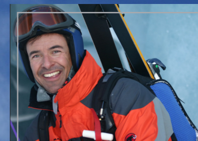
FROZEN ACTION